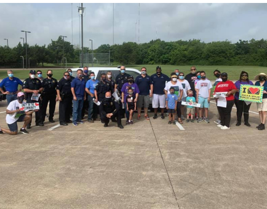
The Cedar Hill Police Department, along with city council members and city staff, led a neighborhood walk in June to visit with neighbors.