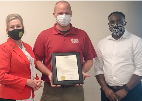
The Cedar Hill City Council recognized Central States Manufacturing for 20 years in business in July.

The Neighborhood Award recipient receives a check in the amount of $250 to be used for community building activities. A runner up will be selected and awarded $100. Nominations should be submitted at cedarhilltx.com/premierneighborhood.com by September 1.