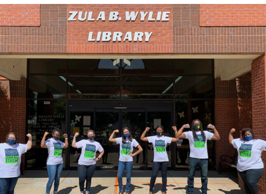
Staff at the Zula B. Wylie Public Library show their support for Cedar Hill businesses.

September 17 is North Texas Giving Day. North Texas Giving Day, an initiative of the Communities Foundation of Texas, is an 18-hour online giving event designed to empower every person to give back to their community by supporting local nonprofits and causes they care about in one easy-to-use platform. Visit northtexasgivingday.org to donate to a local organization or to find more information.